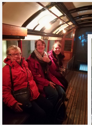
On the trams