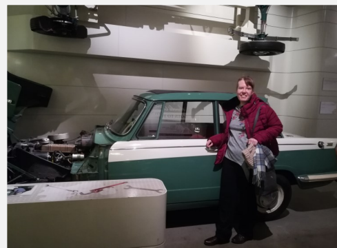
Morven angling for a trip in an Anglia